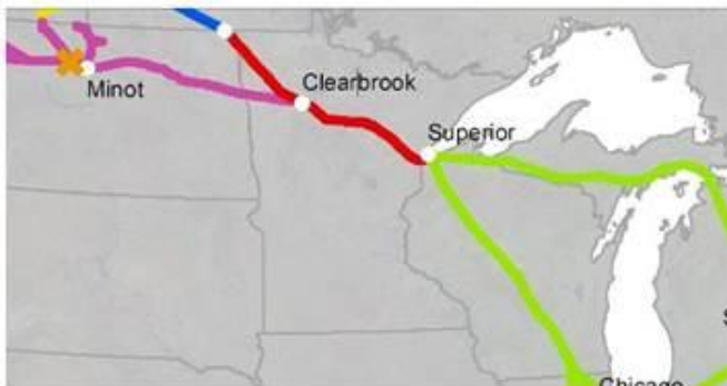
Enbridge’s Line 3 project (red and blue line) runs between Hardisty, Alberta and Superior, Wisconsin.